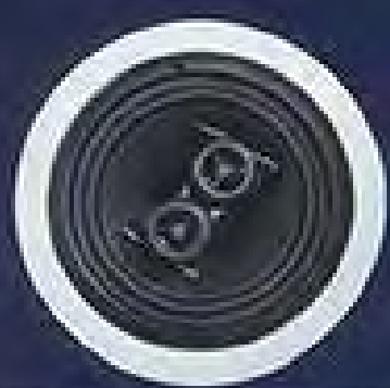
IC6 DVC - 6.5" WOOFER DUAL VOICE COIL