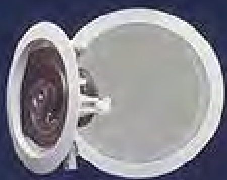
IC5 - 5.25" WOOFER IC6 - 6.5" WOOFER